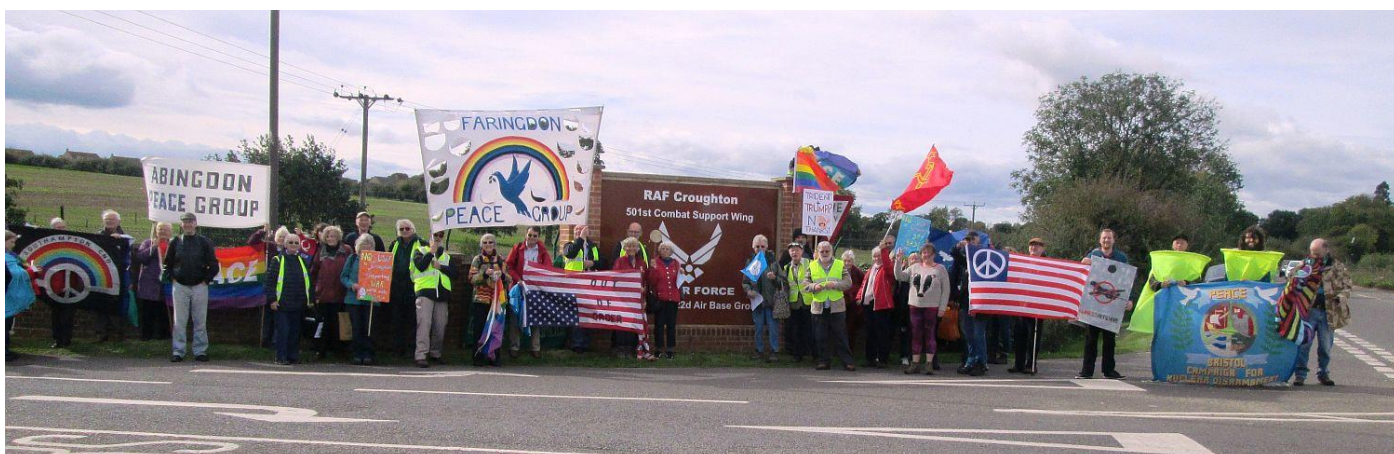
Protest at Croughton during "Keep Space for Peace Week"

Airports: London or Oxford or Luton have good bus connections; The Friends Meeting House is at 43 St Giles', Oxford OX1 3LW - a 20 min walk from Oxford Railway Station.